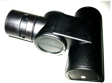
Optional Beater Bar Brush available to meet the EPA RRP requirements.