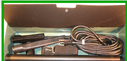
Attachments store conveniently in the lid